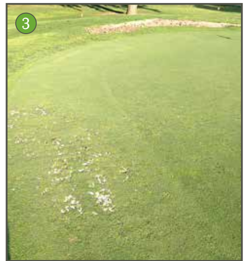
For over 10 years, they could not get this corner to fill using any of the conventional methods. Simple Soil Solution improved coverage and plant health.