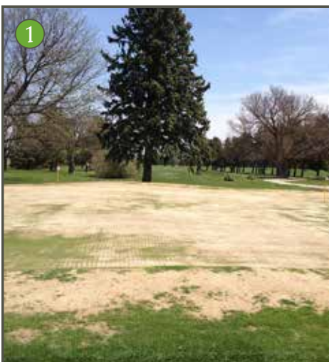
Severe Winter Kill & Compaction

Green was seeded, aerated and treated with Simple Soil Solution. No additional fertilizers or fungicides used!